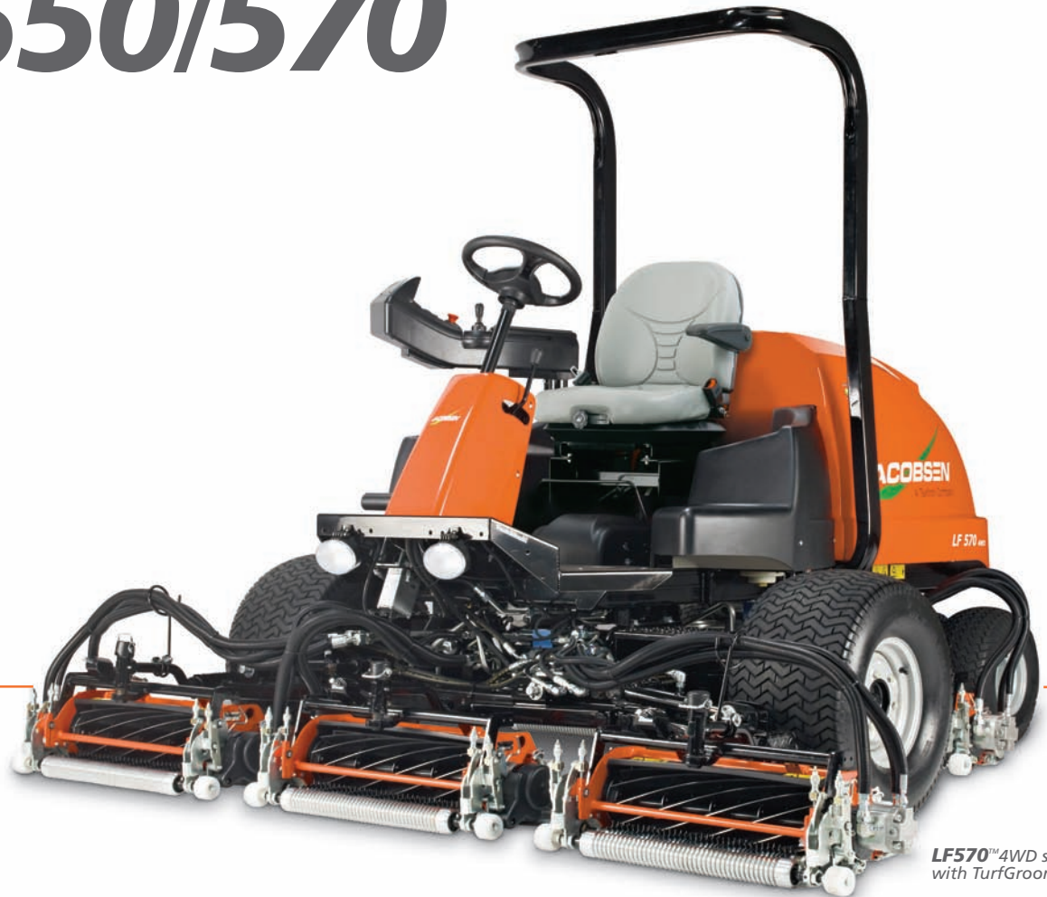
LF570™ 4WD shown with TurfGroomer

Jacobsen's LF550/570 lightweight fairway mowers offer industry leading productivity and functionality through programmable controls, increased performance and simplified maintenance.