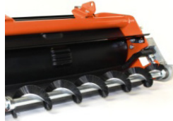
POWERED REAR ROLLING CLEANING BRUSH